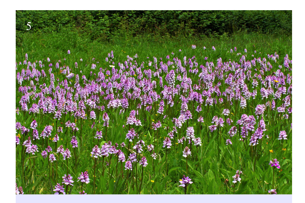
Fig. 5: Population of D. maculata at Southampton Common 2017, showing an anthocyanin-rich plant bottom right.Fig. 6-9: Anthocyanin-rich D. maculata , Southampton Common 2016.

Apart from the above four sites, I was told of a further occurrence in the west of Scotland and Lang (2004) refers to examples having been recorded in Merioneth, Wales. No doubt after the latest Dartmoor record, others will crop up in the future.