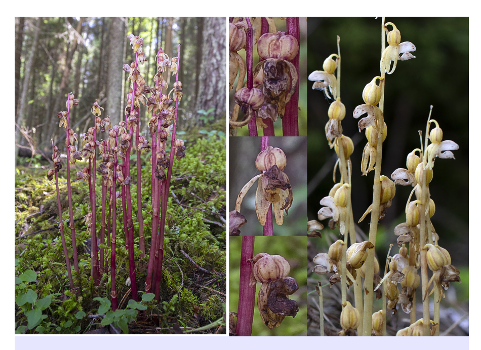
Fig. 20 "Epipogium aphyllum forma rosea"

Given how rare this reddish form is, it is difficult to decide whether this is just coincidence or a more consistently occurring phenomenon. It is certainly worth further investigation should more plants of this form be discovered, and subsequently set seed. Maybe therefore, if the yellow form of Neottia nidus-avis is called forma sulphurea , this reddish form should be called Epipogium aphyllum forma rosea .