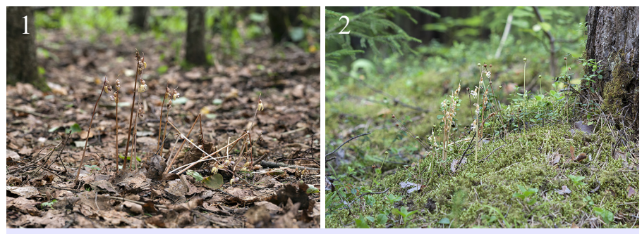
Fig. 1: Epipogium aphyllum growing out of old leaf litter. Fig. 2: Epipogium aphyllum growing on green moss.

In Estonia the Ghost Orchid Epipogium aphyllum is known from approximately 20 locations scattered throughout eastern and central regions, with additional occurrences on the islands of Saaremaa and Hiiumaa to the west. It typically occurs in moist Picea abies and Populus tremula forests, usually with minimal understorey, growing out of old leaf litter (Fig. 1) but sometimes on green moss (Fig. 2).