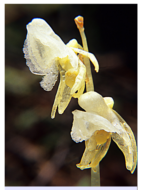
Epipogium aphyllum var. alba

An error occurred during the final print production stage for the last JHOS leading to an image switch in Rosemary Webb's latest 'I Will Have to Come Back Next Year' article.