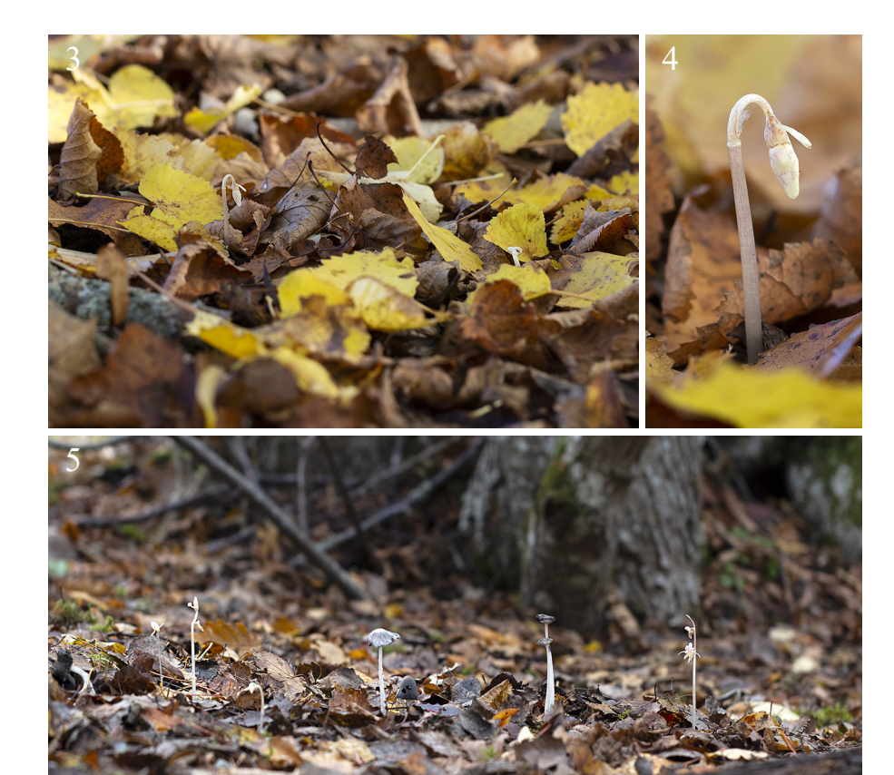
Figs. 3 & 4: Epipogium aphyllum coming into bud among autumnal leaf litter. Fig. 5: First Epipogium aphyllum flower opening amongst six plants.

The latest recorded flowering of the species in Europe is 17<sup>th</sup> October, in Oxfordshire, UK (Cole, 2014), so it was clear that these two small plants might create a new record if they were to survive the impending cold period and manage to produce flowers. This is indeed what happened, with the first flower opening on 29<sup>th</sup> October, by which date six plants had been discovered at the location (Fig. 5)!