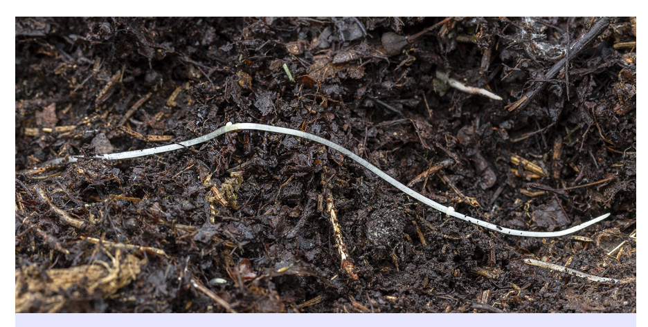
Fig. 9: Stolon of Epipogium aphyllum with two bulbils.