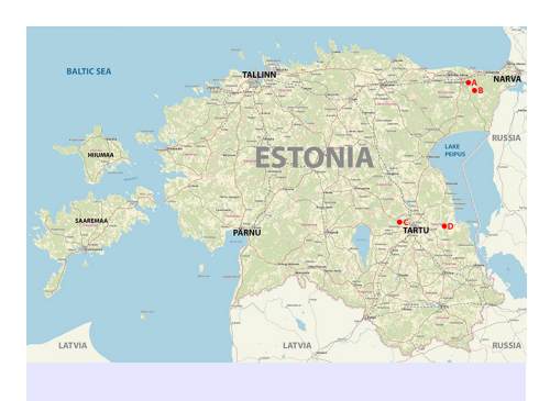
Fig. 18 Location of study sites

to that of either neighbouring populations or others elsewhere in the country. To demonstrate this, I chose two pairs of locations close to each other, in different regions: A & B in north-east Estonia and C & D in the south-east of the country (Fig. 18). A & B have the same temperatures as each other throughout the year, the same amount of sun and clouds and the same amount of rain and humidity. The same is true for C & D (distances between these places: A-B=5km; B-C=110km; C-D=33km).