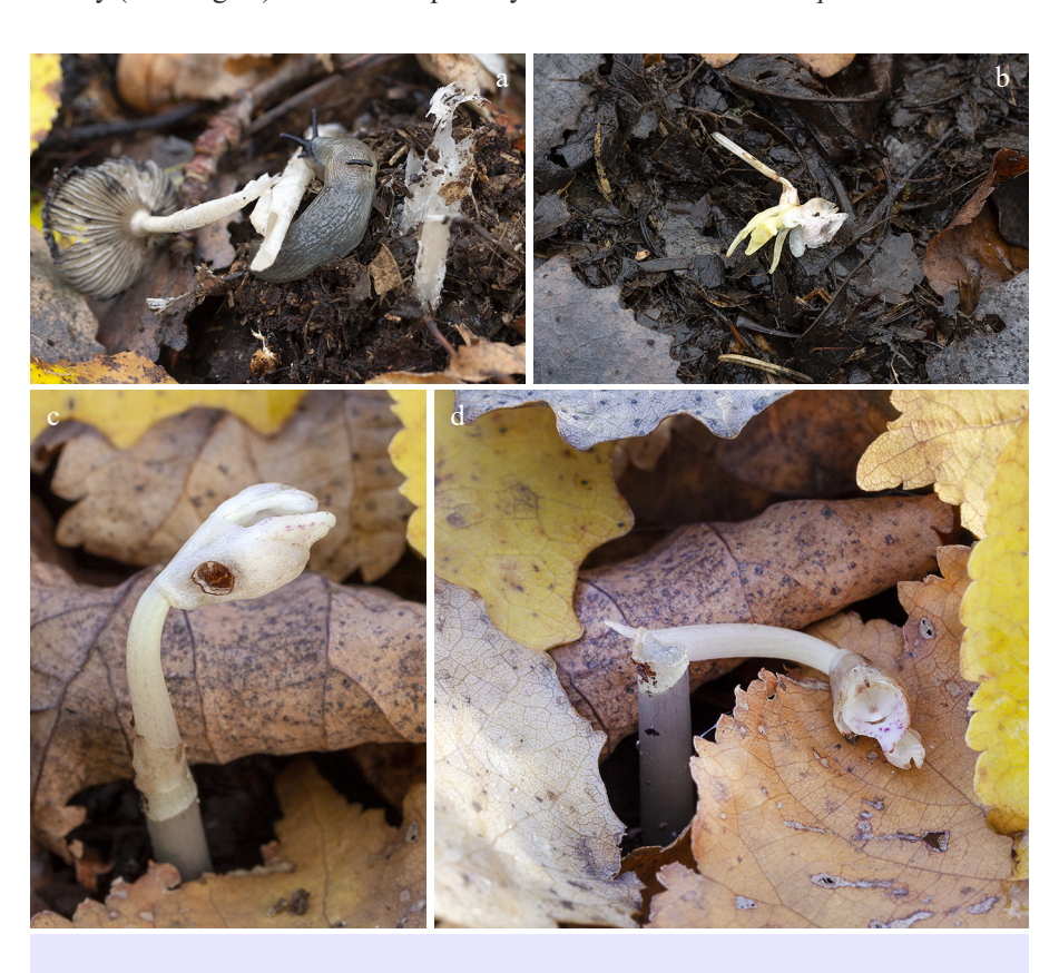
Fig. 7a: Krynickillus melanociphalus eating Coprinus sp. Figs. 7b - 7d: Slug damage to Epipogium aphyllum plants.

Whilst it might have been expected that the temperatures during these plants' emergence would have prevented slug predation, this was not the case. During the early part of emergence, daytime temperatures were reaching up to 10°C and three of the six plants were eaten or broken by slugs between the end of October and mid-November, whilst still in bud. Another three-flowered plant was eaten on 3<sup>rd</sup> or 4<sup>th</sup> November. I have recorded a lot of individuals of the non-native species, Krynickillus melanociphalus (Fig.7 below) eating Coprinus species. It is rapidly expanding in this area since first reported in Estonia in 2014, as are some Malacolimax sp. and other smaller slug species. In fact, slug presence and activity was much greater during the period of this observation than during the more usual flowering period of Epipogium , in July (and August) – this was especially the case for K. melanociphalus .