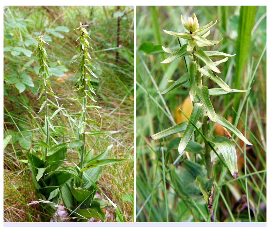
Figs. 5 & 6: The plants with flowerless spikes.

demonstrated by the presence of bracts. There was no evidence of buds dropping off due to unsuitable weather conditions, and there are perfectly normal examples growing alongside them. I will have a look at these in future years, but needless to say it is impossible for these to have any offspring.