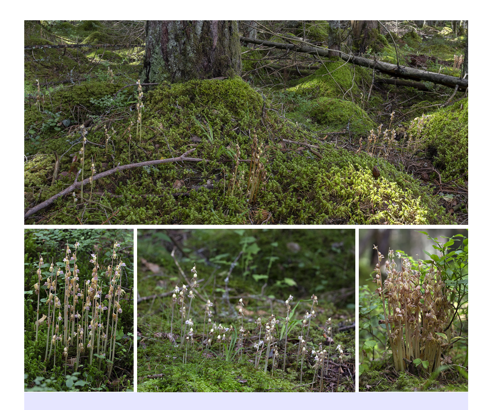
Figs. 12-15: Epipogium plants in probably the largest extant population in Europe.

In order to protect this incredible colony we will not specify the location, but it is in the eastern part of Estonia. The habitat was middle-age Spruce forest mixed with Pine and Birch. No understorey, with clear visibility through the trees for tens of metres. Nearby some forestry work had been carried out. In August it was very dry there, but under leaf litter and moss there was still some humidity. We discovered other achlorophyllous orchid species there – Neottia nidus-avis and Corallorhiza trifida , but both were massively outnumbered by Epipogium .