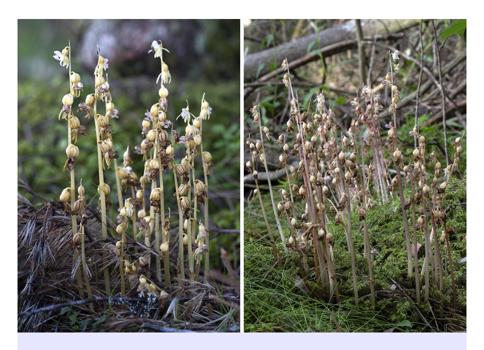
Fig. 17 Epipogium plants with extensive fruit set.

There are many scientific works and books that mention poor or mostly non-existent fruit set of Epipogium . This new, large colony changed our perception of this commonly accepted belief. Fruit set rates were surprisingly high, by visual observation a minimum of 80% (Fig. 17), regardless of location within the colony, the size of plants or number of plants in a group. Given the number of flowering plants (2609), this means many thousands of seed capsules, each containing thousands of small seeds approximately 0.2-0.3mm in size. We measured some capsules and they were huge, the biggest ones up to 15mm in diameter, like small cherries!