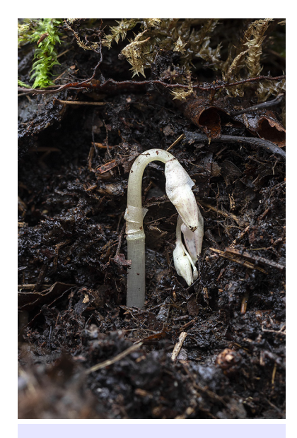
Fig. 8: Epipogium aphyllum plant with curled back stem.

The stolons of Epipogium are very thin and delicate, breaking even with the most careful movement of the associated leaf litter, or even the slightest accidental contact.