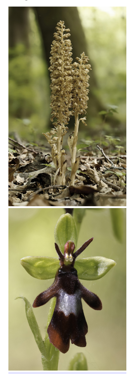
Bird's-nest Orchid (top) Fly Orchid (bottom)