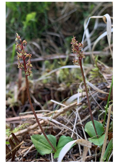
Lesser Twayblade

Two days later, on Saturday 28th May, Elliott Hails led a trip to Exmoor to see Lesser Twayblade, an orchid that is very hard to find unaided. Here is Elliott's account: "Eight of us met at around 10:30 on Exmoor with clear skies and sun. Having walked along a footpath for around a mile or so before heading off-piste to the site; the north facing slope of a steep valley. The vegetation at the site was a mix of bracken and heather with the occasional acidic flush filled with flowering cotton-grass. We quickly identified a number of non-flowering plants. Our first flowering plant came after around 30 minutes of searching under the heather where sphagnum was present. We located six flowering spikes and over 30 non-flowering plants in total. Other notable species included Lemon-scented fern, Eyebrights, Milkwort and a calling Cuckoo."