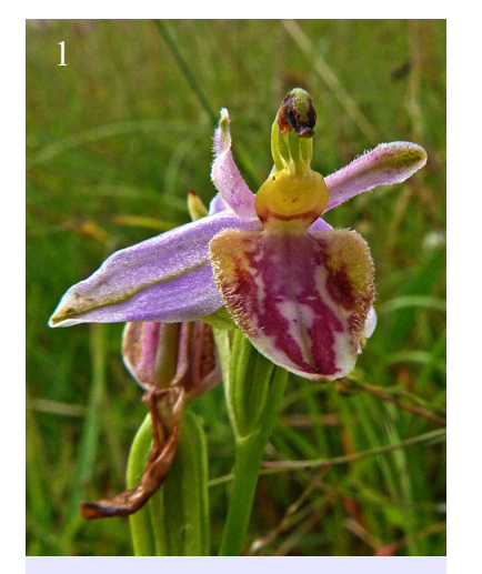
Fig. 1: Unusual Bee Orchid, Wiltshire, June 2020. Note in particular the 'spoon-shaped' upcurved lip, the minimal patterning and the colour.

In mid-June 2020 Sabrina Burns found an unusual looking Bee Orchid, Ophrys apifera , on public access land adjacent to the closed MOD firing range in Wiltshire. She posted images on the Native Orchids of Britain and Ireland Facebook forum showing a flower that was only partially open. The images raised quite a bit of discussion, particularly when somebody pointed out the similarities to a plant found in France at around the same time which had been labelled as var. tilaventina , a variant that had never been recorded in Britain before. Sabrina subsequently posted a further series of images of the plant showing the flower fully open and Andrew Brown visited the site in late June to see for himself (Figure 1).