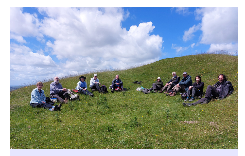
Wiltshire Downs field trip