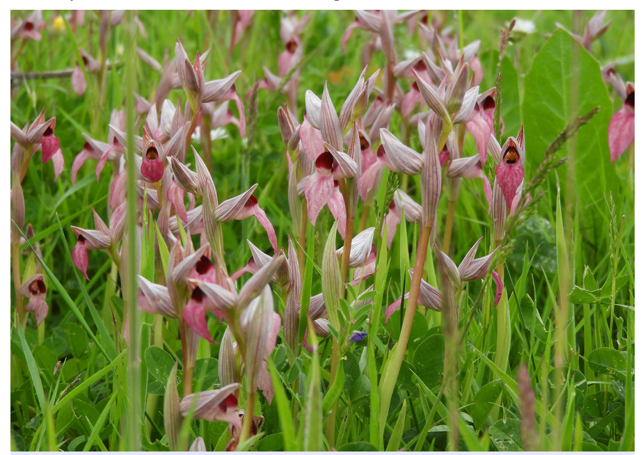
Serapias lingua (winner of Class 10 in the Photographic Competition 2022)

only a few flowers open. Overall we had seen an impressive number of eight species of orchid (with seven in flower) in their classic downland habitat. £63 was donated to Surrey Wildlife Trust who maintain Sheepleas."