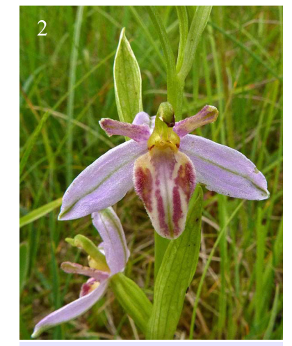
Fig. 2: Unusual Bee Orchid 25<sup>th</sup> June 2021 Wiltshire. Note the elongated flattened lip, with the basal area stained the same shade as the petals, and the longitudinal white stripes

Figures 3-7 give an indication of the range of plants at the site, particularly the more unusual. So, what are these plants? They do not fit any named forms that I am aware of, particularly as they are all different from each other, and one cannot describe them as a new form as what is the defining feature? Why most plants at this site should show such a wide range of variation is a mystery.