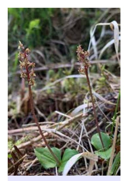
Lesser Twayblade

Two days later, on Saturday 28th May, Elliott Hails led a trip to Exmoor to see Lesser Twayblade, an orchid that is very hard to find unaided. Here is Elliott's account: "Eight of us met at around 10:30 on Exmoor with clear skies and sun. Having walked along a footpath for around a mile or so before heading off-piste to the site; the north facing slope of a steep valley. The vegetation at the site was a mix of bracken and heather with the occasional acidic flush filled with flowering cotton-grass. We quickly identified a number of non-flowering plants. Our first flowering plant came after around 30 minutes of searching under the heather where sphagnum was present. We located six flowering spikes and over 30 non-flowering plants in total. Other notable species included Lemon-scented fern, Eyebrights, Milkwort and a calling Cuckoo."