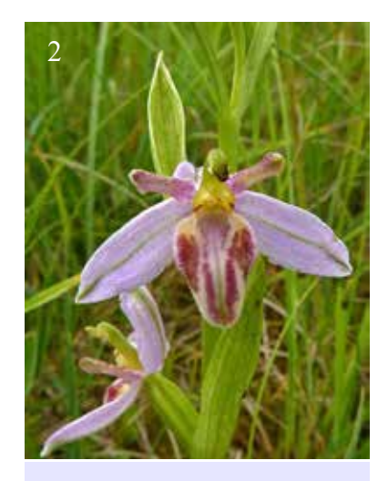
Fig. 2: Unusual Bee Orchid 25<sup>th</sup> June 2021 Wiltshire. Note the elongated flattened lip, with the basal area stained the same shade as the petals, and the longitudinal white stripes

Figures 3-7 give an indication of the range of plants at the site, particularly the more unusual. So, what are these plants? They do not fit any named forms that I am aware of, particularly as they are all different from each other, and one cannot describe them as a new form as what is the defining feature? Why most plants at this site should show such a wide range of variation is a mystery.