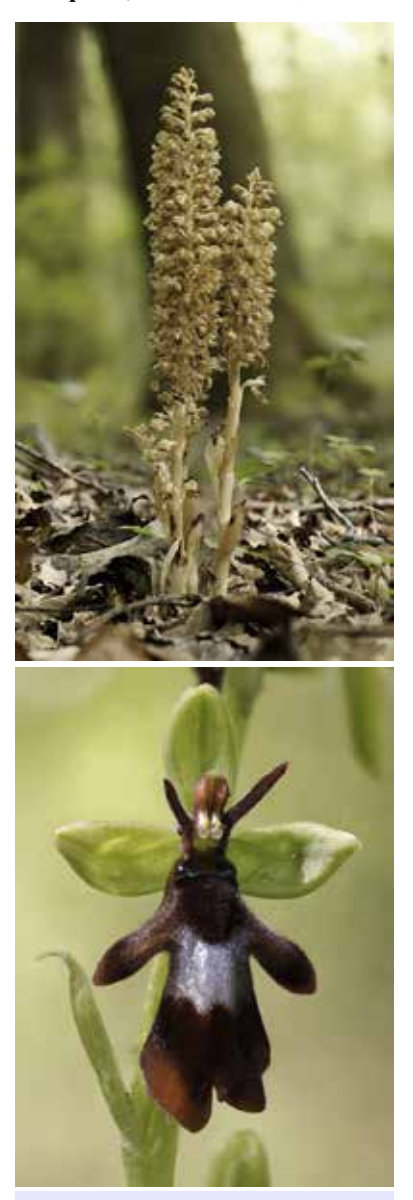
Bird's-nest Orchid (top) Fly Orchid (bottom)