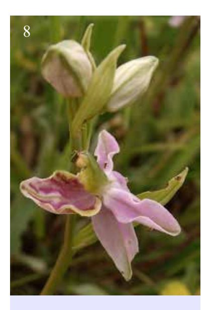
Fig. 8: Unusual Bee Orchid, 12<sup>th</sup> June 2018, Wiltshire.