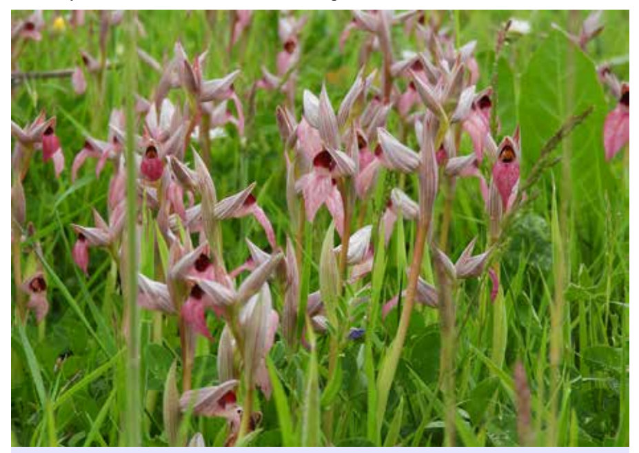
Serapias lingua (winner of Class 10 in the Photographic Competition 2022)

only a few flowers open. Overall we had seen an impressive number of eight species of orchid (with seven in flower) in their classic downland habitat. £63 was donated to Surrey Wildlife Trust who maintain Sheepleas."