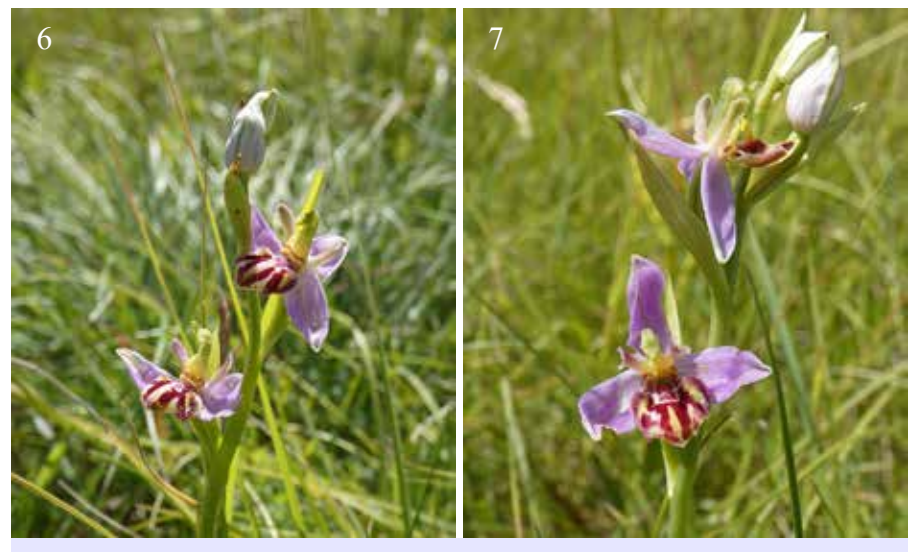
Fig. 3: Two flowers on the same stem, both with the flattened lip but different lip patterning, 2<sup>nd</sup> July 2021, Wiltshire.

Fig. 4: The basal shield split into two, a distorted speculum and pale longitudinal stripes down the lip, 2<sup>nd</sup> July 2021, Wiltshire.