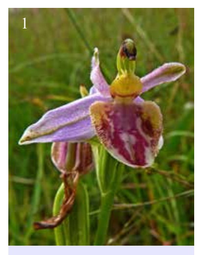
Fig. 1: Unusual Bee Orchid, Wiltshire, June 2020. Note in particular the 'spoon-shaped' upcurved lip, the minimal patterning and the colour.

In mid-June 2020 Sabrina Burns found an unusual looking Bee Orchid, Ophrys apifera , on public access land adjacent to the closed MOD firing range in Wiltshire. She posted images on the Native Orchids of Britain and Ireland Facebook forum showing a flower that was only partially open. The images raised quite a bit of discussion, particularly when somebody pointed out the similarities to a plant found in France at around the same time which had been labelled as var. tilaventina , a variant that had never been recorded in Britain before. Sabrina subsequently posted a further series of images of the plant showing the flower fully open and Andrew Brown visited the site in late June to see for himself (Figure 1).