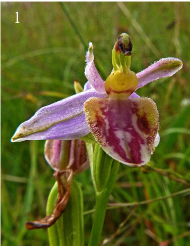
Fig. 1: Unusual Bee Orchid, Wiltshire, June 2020. Note in particular the ‘spoon-shaped’ upcurved lip, the minimal patterning and the colour.

In mid-June 2020 Sabrina Burns found an unusual looking Bee Orchid, Ophrys apifera , on public access land adjacent to the closed MOD firing range in Wiltshire. She posted images on the Native Orchids of Britain and Ireland Facebook forum showing a flower that was only partially open. The images raised quite a bit of discussion, particularly when somebody pointed out the similarities to a plant found in France at around the same time which had been labelled as var. tilaventina , a variant that had never been recorded in Britain before. Sabrina subsequently posted a further series of images of the plant showing the flower fully open and Andrew Brown visited the site in late June to see for himself (Figure 1).