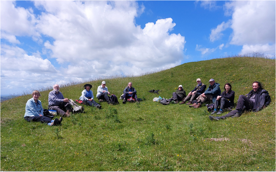
Wiltshire Downs field trip