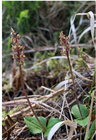
Lesser Twayblade

Two days later, on Saturday 28 th May, Elliott Hails led a trip to Exmoor to see Lesser Twayblade, an orchid that is very hard to find unaided. Here is Elliott's account: "Eight of us met at around 10:30 on Exmoor with clear skies and sun. Having walked along a footpath for around a mile or so before heading off-piste to the site; the north facing slope of a steep valley. The vegetation at the site was a mix of bracken and heather with the occasional acidic flush filled with flowering cotton-grass. We quickly identified a number of non-flowering plants. Our first flowering plant came after around 30 minutes of searching under the heather where sphagnum was present. We located six flowering spikes and over 30 non-flowering plants in total. Other notable species included Lemon-scented fern, Eyebrights, Milkwort and a calling Cuckoo."