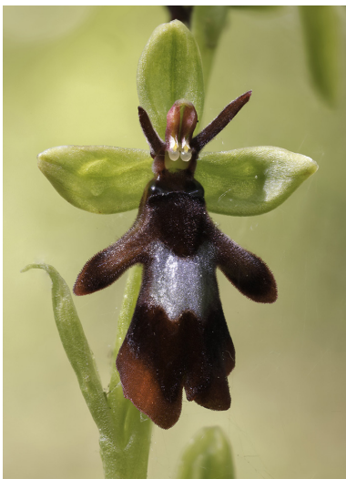
Bird's-nest Orchid (top) Fly Orchid (bottom)