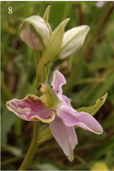
Fig. 8: Unusual Bee Orchid, 12 th June 2018, Wiltshire.