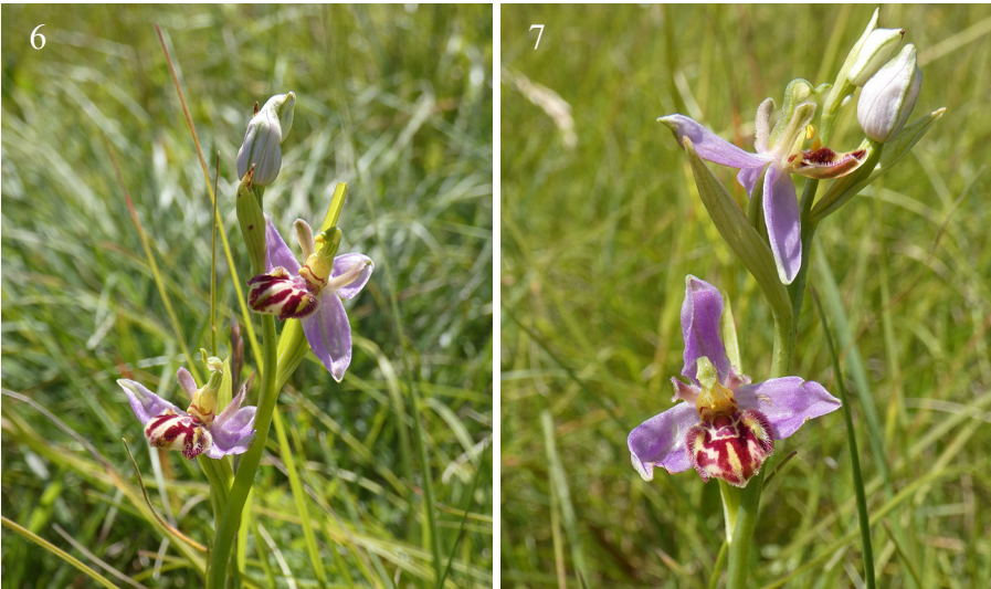
Fig. 3: Two flowers on the same stem, both with the flattened lip but different lip patterning, 2 nd July 2021, Wiltshire.