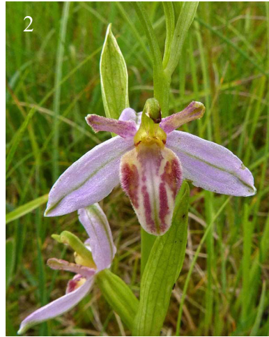
Fig. 2: Unusual Bee Orchid 25 th June 2021 Wiltshire. Note the elongated flattened lip, with the basal area stained the same shade as the petals, and the longitudinal white stripes

Figures 3-7 give an indication of the range of plants at the site, particularly the more unusual. So, what are these plants? They do not fit any named forms that I am aware of, particularly as they are all different from each other, and one cannot describe them as a new form as what is the defining feature? Why most plants at this site should show such a wide range of variation is a mystery.