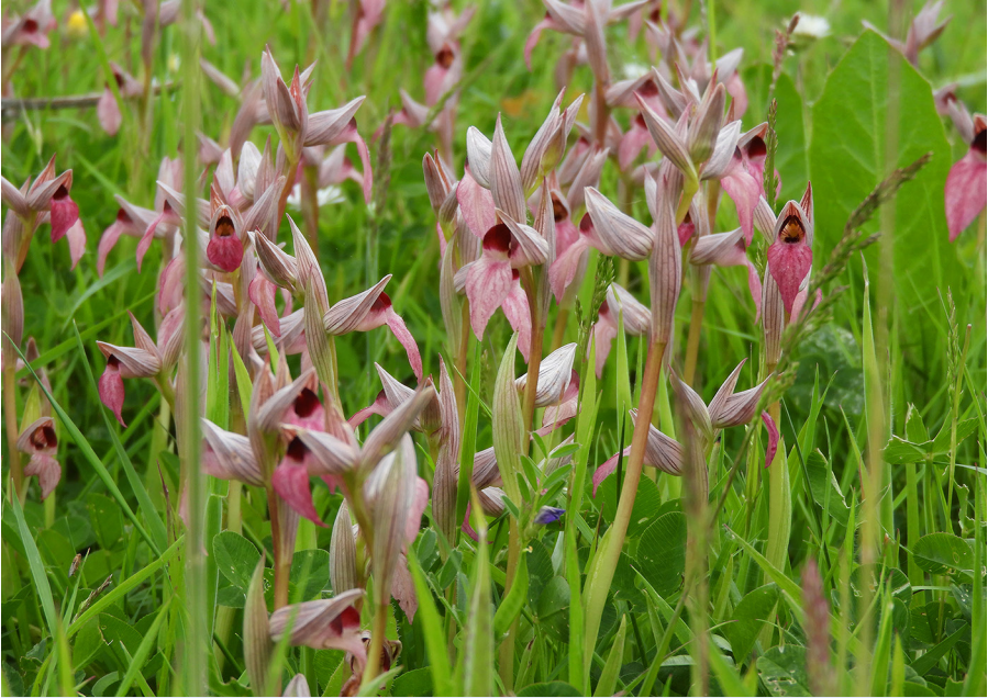
Serapias lingua (winner of Class 10 in the Photographic Competition 2022)

only a few flowers open. Overall we had seen an impressive number of eight species of orchid (with seven in flower) in their classic downland habitat. £63 was donated to Surrey Wildlife Trust who maintain Sheeples.”