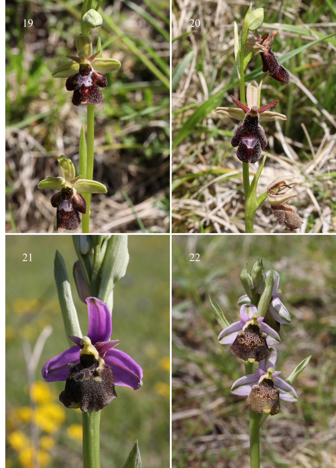
Fig. 19: Ophrys insectifera × fuciflora , Rochefort Samson St-Gens, 12<sup>th</sup> May. Fig. 20: Ophrys insectifera × drumana , Rochefort Samson St-Gens, 12<sup>th</sup> May. Fig. 21: Ophrys fuciflora , Rochefort Samson St-Gens, 12<sup>th</sup> May. Fig. 22: Ophrys fuciflora × drumana , Rochefort Samson St-Gens, 12<sup>th</sup> May.