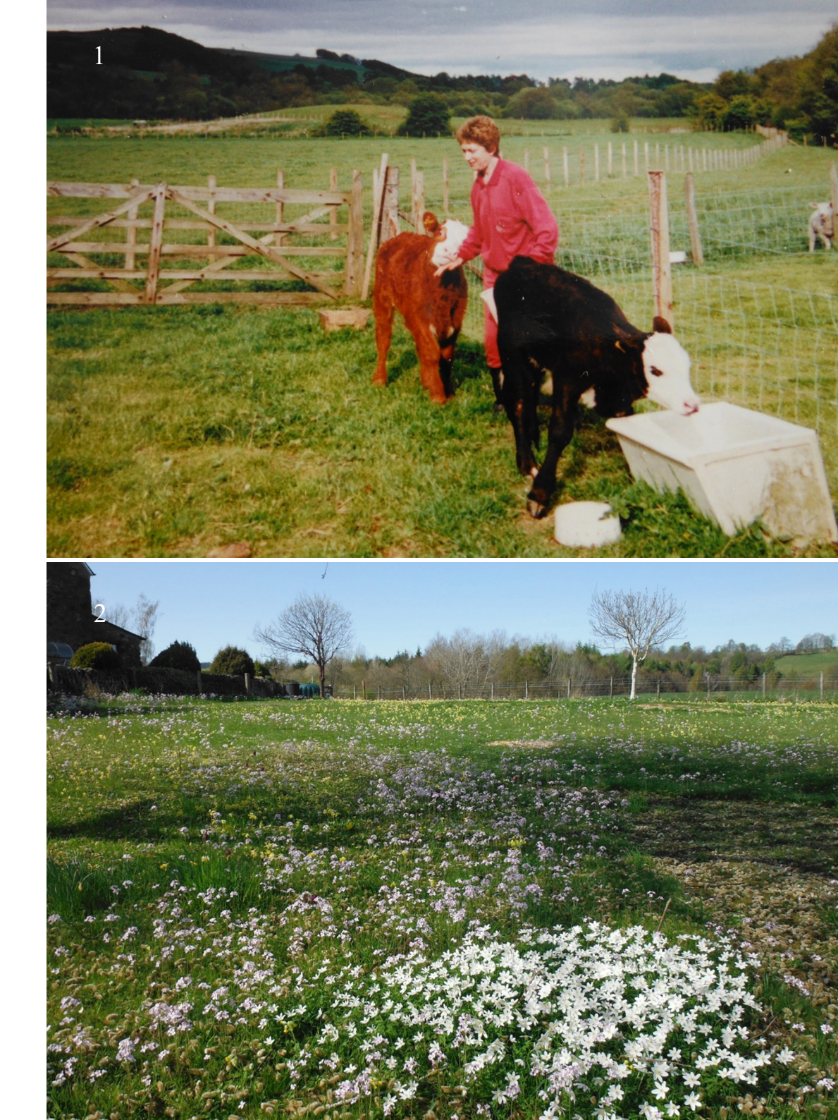
Figure 2. Our wildflower meadow, looking north in the spring of 2020.

Figure 1. Jean feeding calves in the early 1990s. The grass paddock that is to become the wildflower meadow is through the gate and to the right of the fence stretching into the distance. The field that once it was a part of is to the left of the fence.