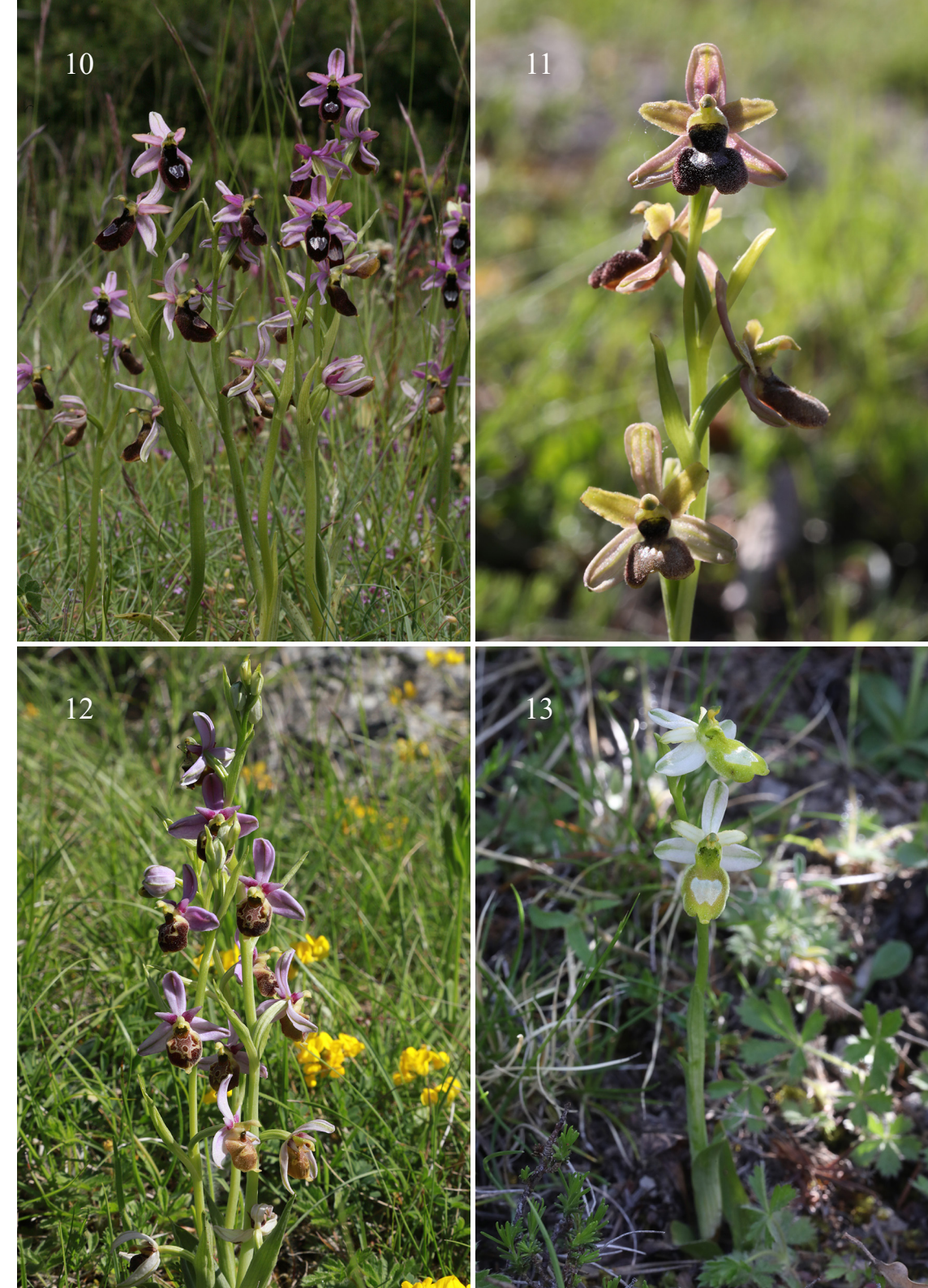
Fig. 11: Ophrys araneola × drumana , Rochefort Samson St-Gens, 12<sup>th</sup> May. Fig. 12: Ophrys fuciflora var. demangei Rochefort Samson St-Gens, 12<sup>th</sup> May. Fig. 13: An albinistic form of Ophrys drumana , Rochefort Samson St-Gens, 12<sup>th</sup> May.

Fig. 10: Ophrys drumana, Col Bacchus, 6th June.