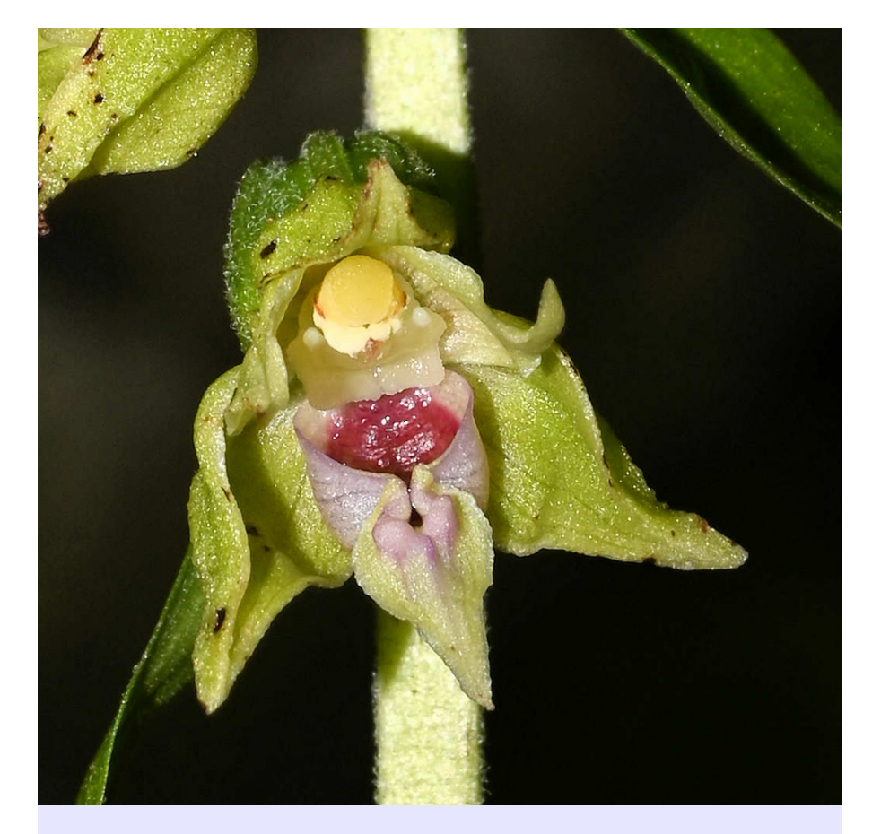
Fig. 4: Close-up of one of the Narrow-lipped Helleborine flowers, with the pollen just starting to crumble onto the stigma.

Normally, Narrow-lipped Helleborines grow on limestone or chalk soils. With Chalky Boulder Clay the amount of chalk or limestone can be very variable. Richard also notes: "The lip shape, colour, posture of the flowers, and vegetative characters are all consistent with leptochila (though I'd tend to view this occurrence as being three plants rather than one, while recognising that the three stems might originally have shared the same rhizome)." A later email from Richard also notes that in the new UK plant atlas Epipactis leptochila is rapidly declining post-1987.