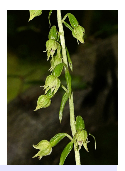
Fig. 1 (opposite): Three stems of Narrow-lipped Helleborine. Fig. 2: (above) Close-up of a Narrow-lipped Helleborine stem. Note the nodding flowers. The epichile can just be seen on some of the flowers.

In mid-July 2023, similar helleborine plants were found by the authors, including three close-together flowering stems (Fig. 1). The plants, on closer examination, showed some interesting features indicative of Narrow-lipped Helleborine, a nationally scarce orchid, which has been recorded in other nearby counties along the Chilterns, including Hertfordshire, Oxfordshire and Buckinghamshire. The flowers had a narrow pointed epichile, coloured green and pink. Many of the flowers were drooping (Fig. 2) much like a Green-flowered Helleborine (Epipactis phyllanthes). However, the colour at the back of the hypochile was red, unlike Green-flowered Helleborines where it is green.