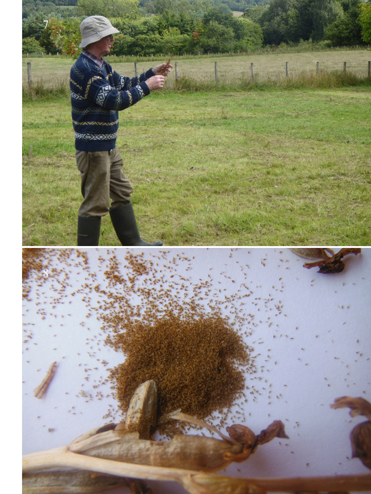
Figure 8. Seed of Lesser-butterfly-orchid (Platanthera bifolia).

Figure 7. Spreading seed in the autumn by opening seed capsules whilst moving up-wind.