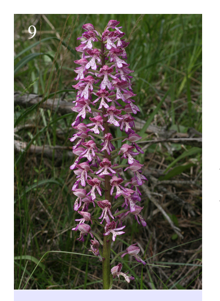
Fig. 9: Orchis ×angusticruris (Orchis purpurea × simia). Col du Prayet, 10^{\text{th}} June.

a splendid lip (the subspecies is smaller) as well as the hybrid Op. fuciflora ssp. demangei \times Op. drumana . This had the colours and markings of the Op. drumana lip. Then we had much prettier find; a yellow-albinistic form of Op. drumana .