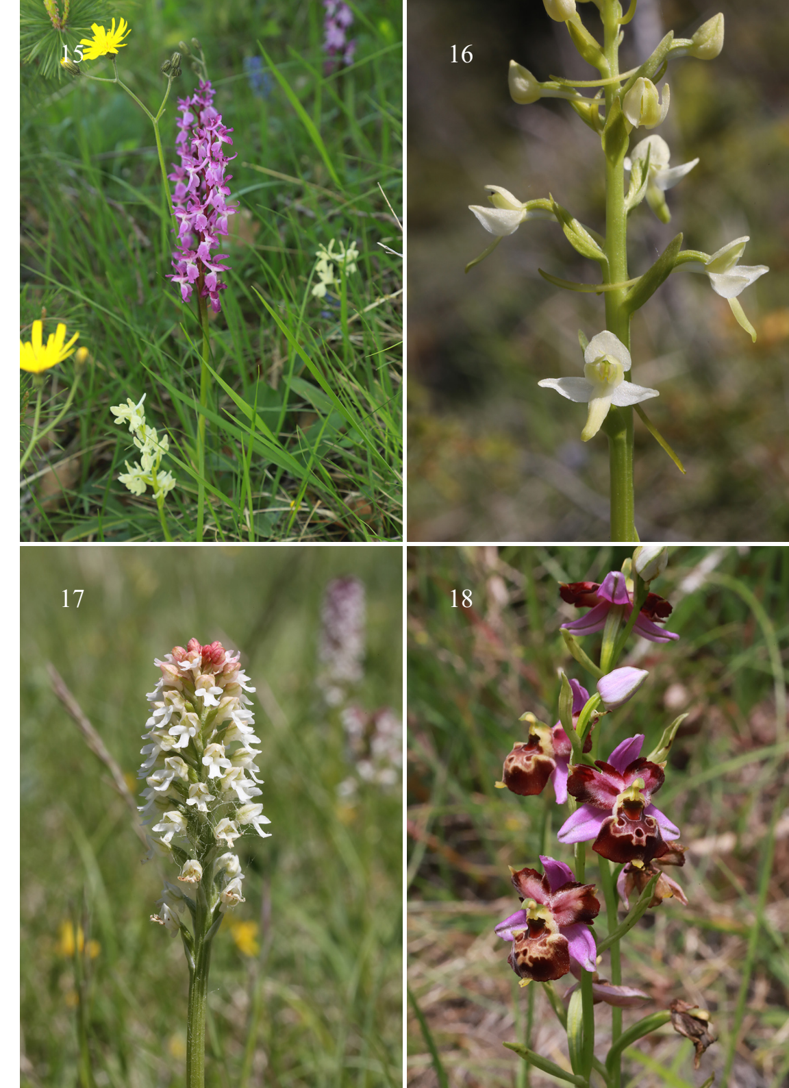
Fig. 18: Ophrys fuciflora 'Mickey Mouse' monstrosity, Rochefort Samson St-Gens, 12<sup>th</sup> May (also see back cover).

Fig. 17: An albinistic form of Neotinea ustulata , Rochefort Samson St-Gens, 12<sup>th</sup> May.