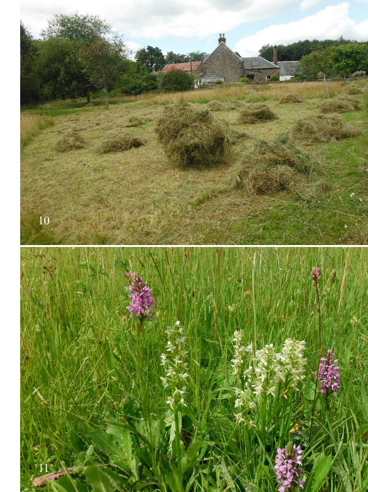
Figure 11. A plant of Platanthera bifolia that has flowered every year since 2007 and appears to have increased vegetatively.

Figure 10. Starting to take a hay crop off part of our meadow in late August 2019.